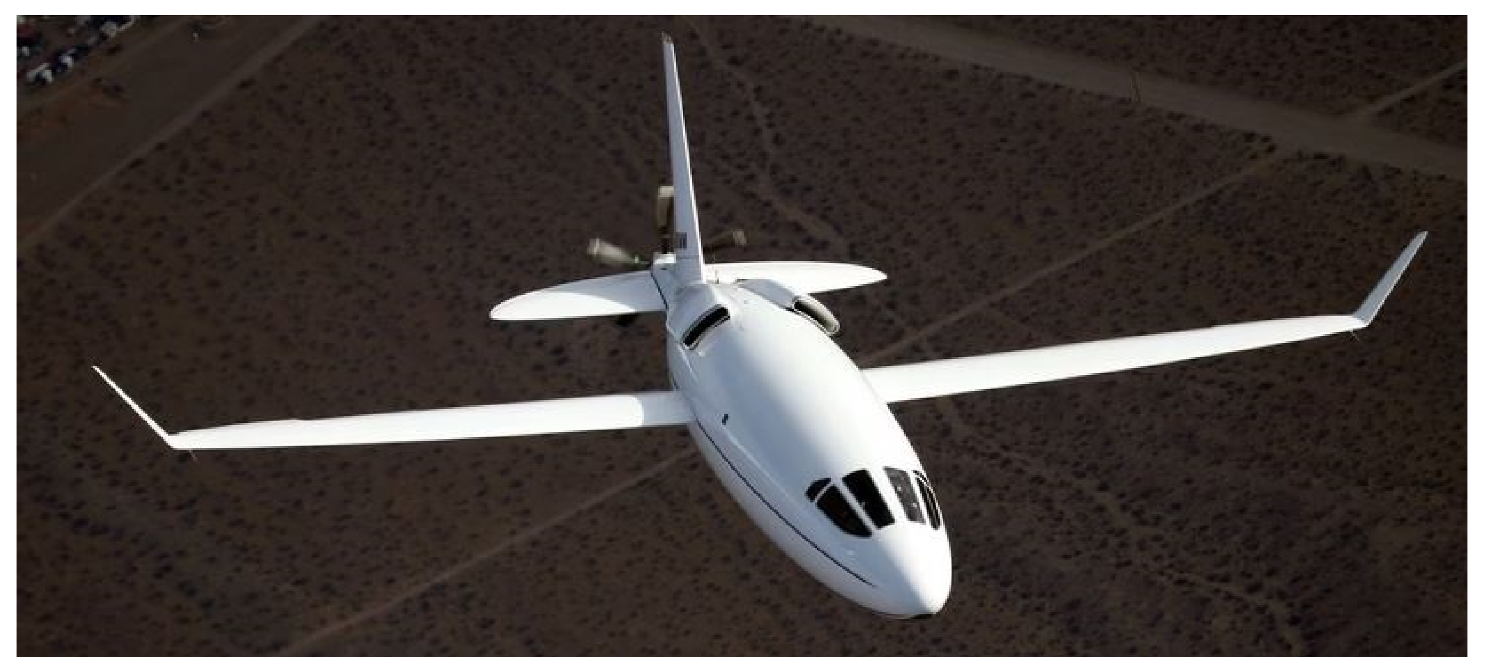
Figure 1: Celera 500L from Otto Aviation (USA).

A comparison of engine options for large passenger aircraft including diesel engines could not be found in the literature. It is now part of the scientific body of knowledge.